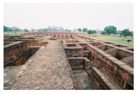
Excavated Remains of Nalanda Mahavihara