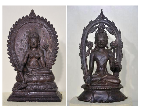
Nalanda Archaeological Museum