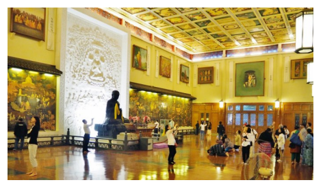
Nava Nalanda Mahavihara