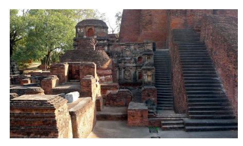
Excavated Remains of Nalanda Mahavihara